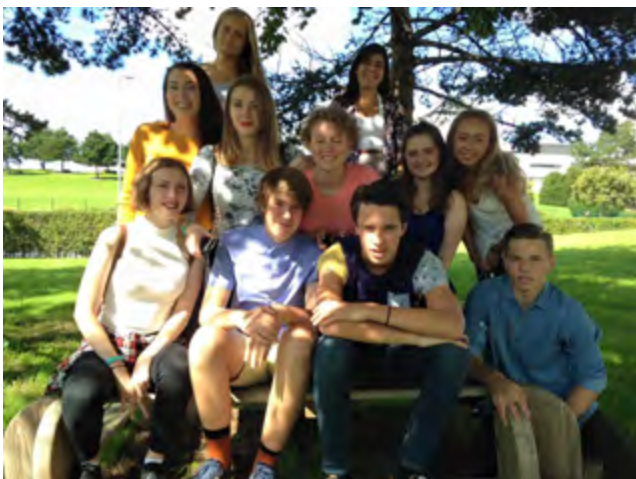
The Hordaland Class in France 2015–2016