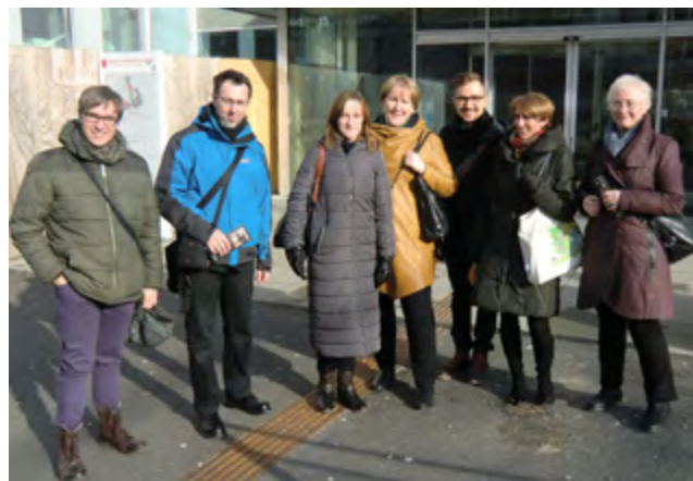
The delegation from the University of Lodz

and infrastructure, and visited both Bergen Light Rail and the new charge station for hydrogen cars. Also the conditions and infrastructure for electric cars in Hordaland were presented.