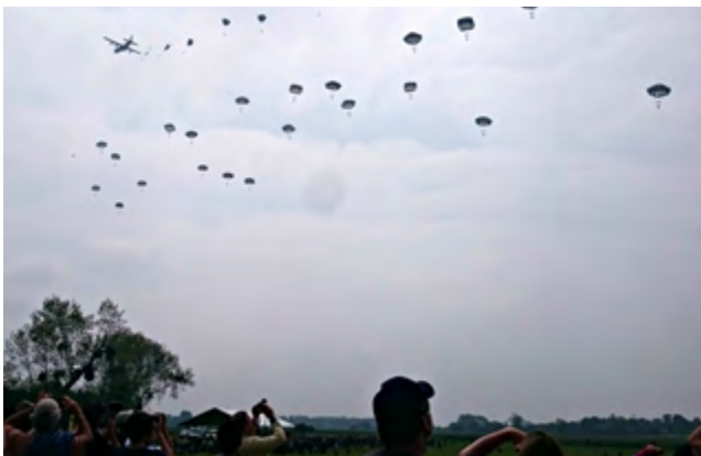
Military and historic reconstruction of parachutists on D-Day in La Fièvre, near Sainte-Mère-Église, Normandy.

Hordaland County Council was one of the financial contributors to the workshop. Two Norwegian students from Bergen Academy of Art and Design made photographs of war memorials which they will use for an exhibition in the future.