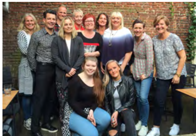
Representatives from Pluscoach, Mot Askøy, and Hordaland County Council.

Part of the programme in the Netherlands was also a visit to Studio Moio, where early school leavers work on social innovation projects. Studio Moio visited Impact Hub in Bergen and talks about future project cooperation have started. Askøy municipality also plans to establish a host project for EVS volunteers.