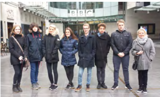
International English students at BBC Broadcasting House in London.