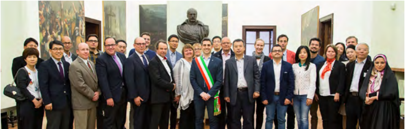
Mayor of Parma Federico Pizzarotti and visiting delegats from other UNESCO cities of gastronomy.