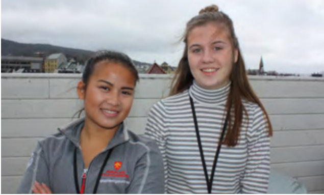
Apprenticeship placement at a German University

administration and the daily routine of the offices, as well as experiencing first-hand how a typical work day is for a German apprentice in Public Administration.