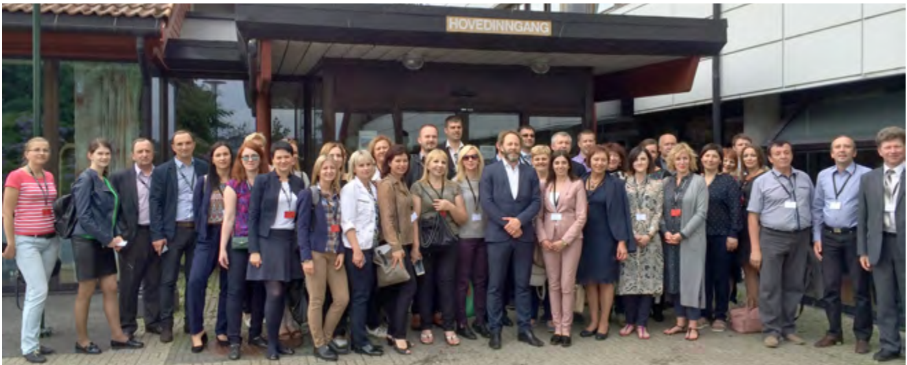
The Lithuanian delegation together with representatives from Hordaland County Council and Fjell Municipality.