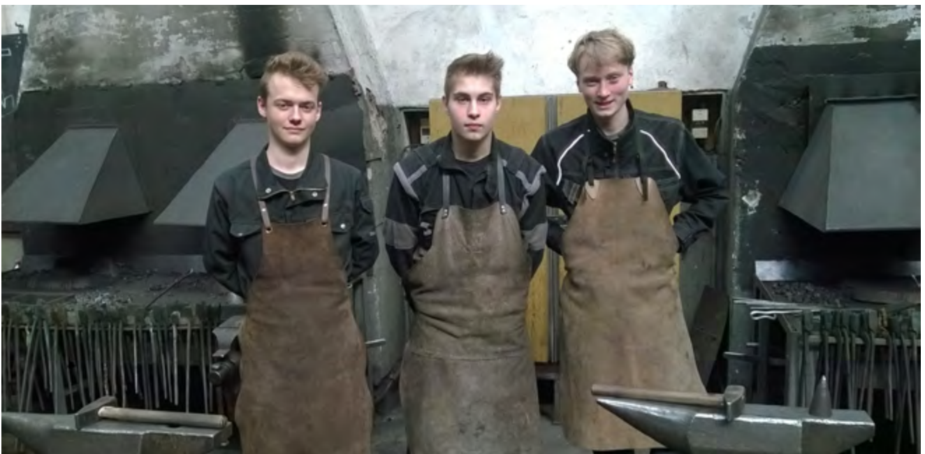
Blacksmith students in the Czech Republic

The students have learned about traditional and historic developments and practices related to the blacksmith and farrier trades. The students had the opportunity to try different techniques and work with materials they would not have had access to in Norway. They have experienced their trade from several different aspects, and have participated in systematic work where they have followed projects from start to finish, made sculptures and various other products, as well as restoration work and surface treatment. Another new experience