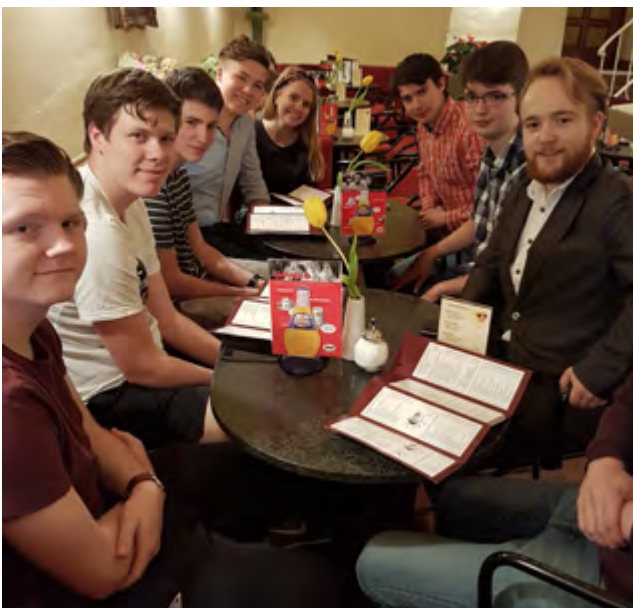
Happy Electricity and Electronics students from Hordaland, celebrating their final exam at a cafe in Erfurt.