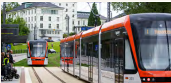
Bergen Light Rail

UITP is a good arena to gain knowledge and network for development of public transport. The organization has different working groups. For Hordaland the groups for Light rail and for Trolley busses are of particular interest. http://www.uitp.org/