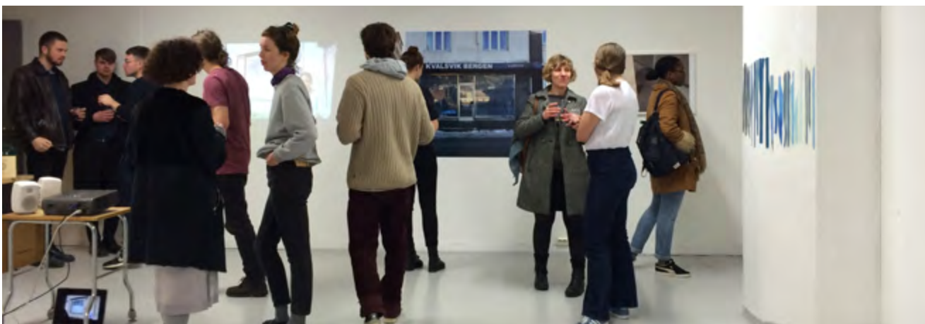
Open Studio in Bergen.