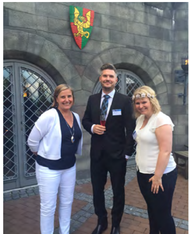
The Hordaland secretariat wishes to thank everyone for all cooperation the last two years, and good luck with the work ahead!

Examples of best practice, “North Sea Region in numbers” statistical document and the updated action plan will be added as addendums to the strategy paper.