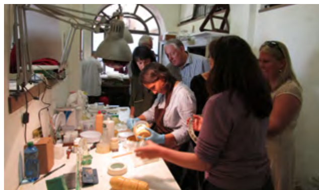
The Odda delegation observes the restoration of a chandelier.