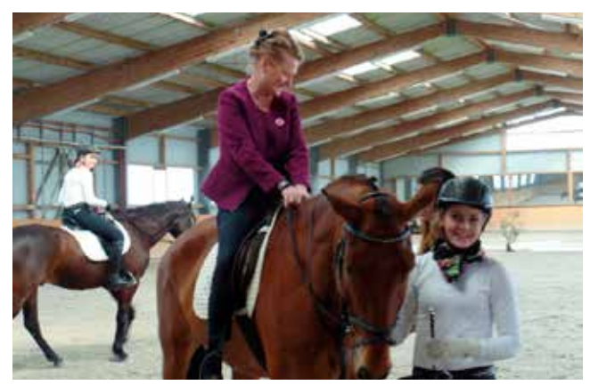
Photo: The horse riding students inspired the Norwegian ambassador Tove Skarstein to take a ride on horseback herself!