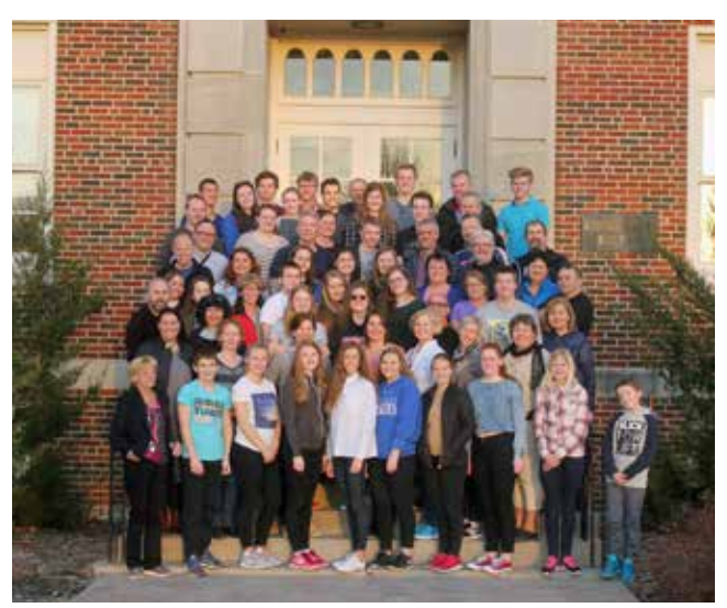
Photo: Group picture of the Hordaland class in Missouri, and parents, in front of the Administration building at St. Paul Lutheran High.