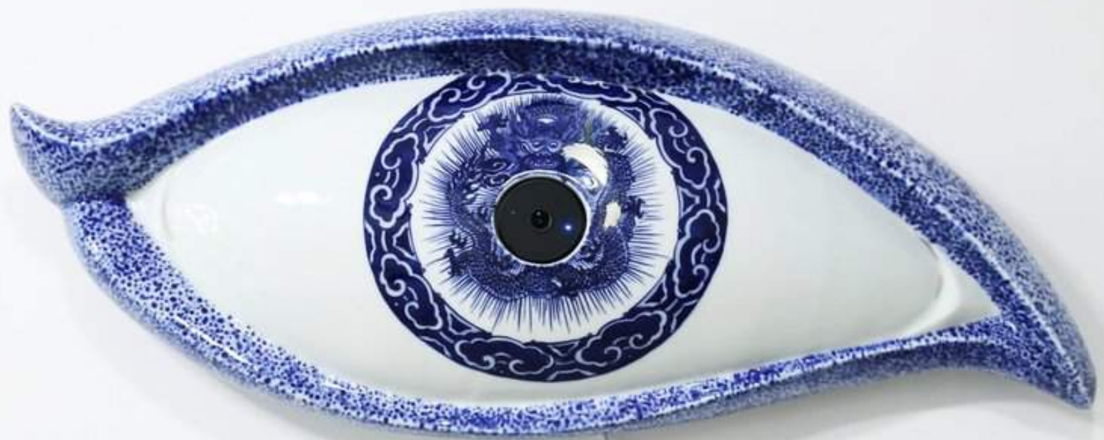
I Have Got Your Blue Eyes Interactive installation material: porcelain, micro camera size:65cm x 45cm year of making: 2017