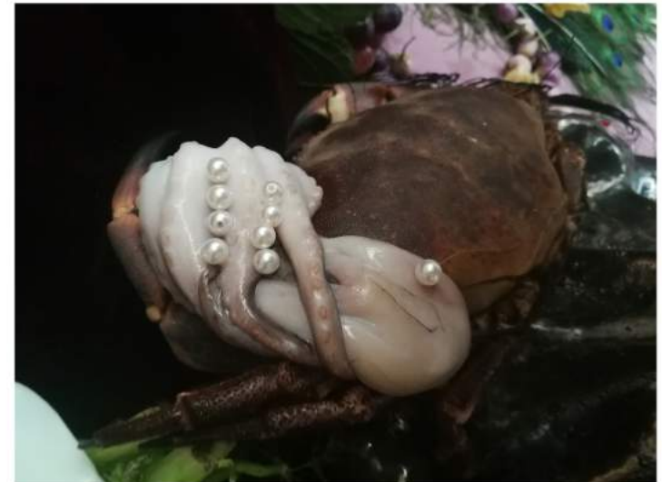
Exotic Dreams and Poetic Misunderstanding Project - Performance Dinner

Tårnsalen, KODE.4 Art Museums, interactive performances, porcelain installations, food. Solo event/ exhibition, Bergen, Norway.