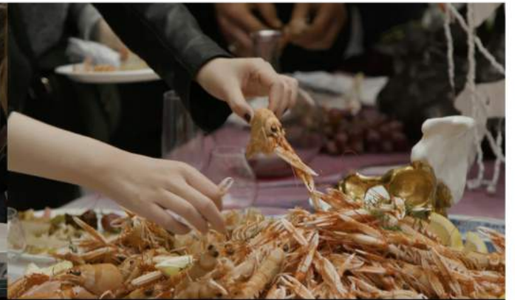
Exotic Dreams and Poetic Misunderstanding Project - Performance Dinner Tårnsalen, KODE.4 Art Museums, interactive performances, porcelain installations, food. Solo event/ exhibition, Bergen, Norway. 14th May, 2018