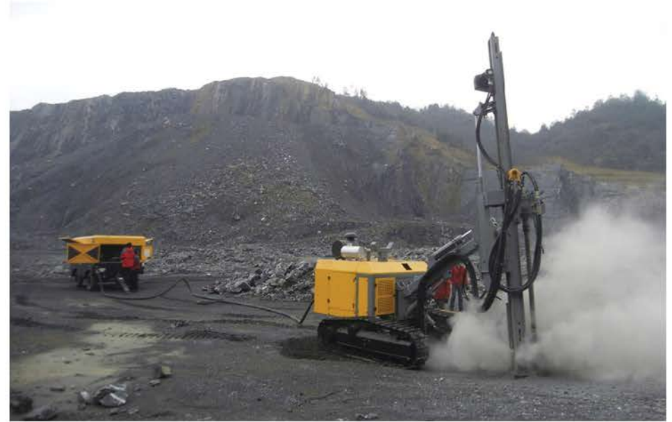
Borrmaskin för kärnbörning (ref. STYRUD AB).