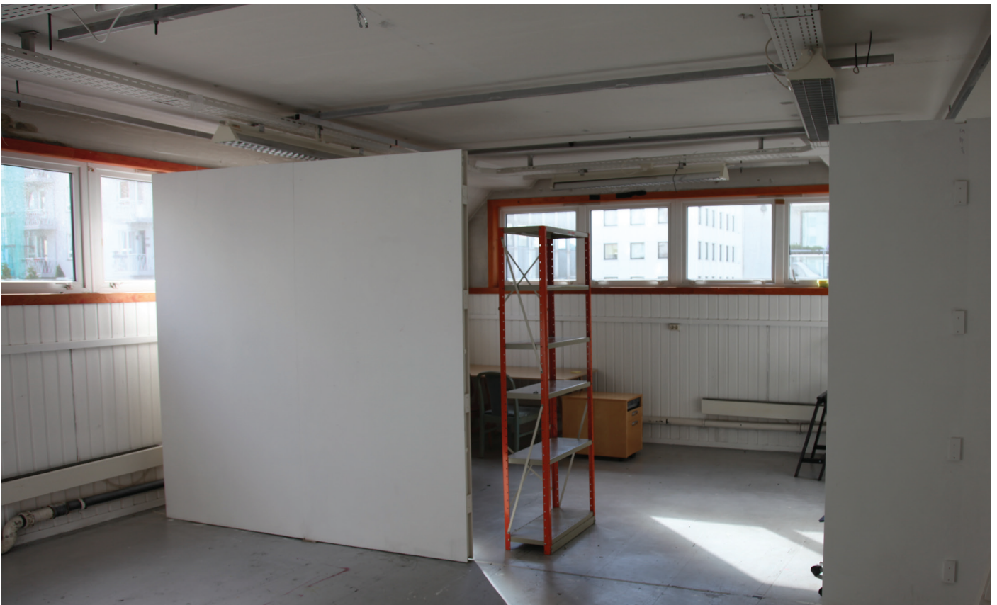
Image showing one of the spaces on the 6th floor which will be turned into an artist studio

3 of the floors that we take over will be turned into artist studios. See the document "construction and development" for building plans. Our primary objective is to support studios for contemporary artists but we will also include a few practitioners from outside the visual art field in order to leverage a level of multidisciplinary collaboration in the building. For instance Borealis festival for experimental music has expressed interest in renting one of the spaces. We have had an "open house" in december 2016 to survey interest of potential tenants, resulting in over 30 people signing up for only one of the 3 floors. We are also in dialogue with other studio collectives in Bergen about them moving into this house. Most of the existing collectives don't have a long term lease like we do (10 years), and the studios are in general much smaller and without the type of facilities that we will provide.