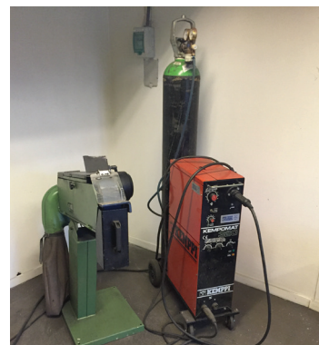
Images of some of the equipment we have received as donations for the workshop