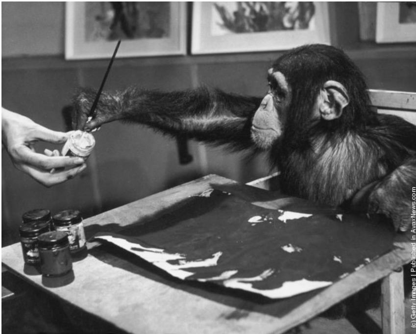
heroine's archive image