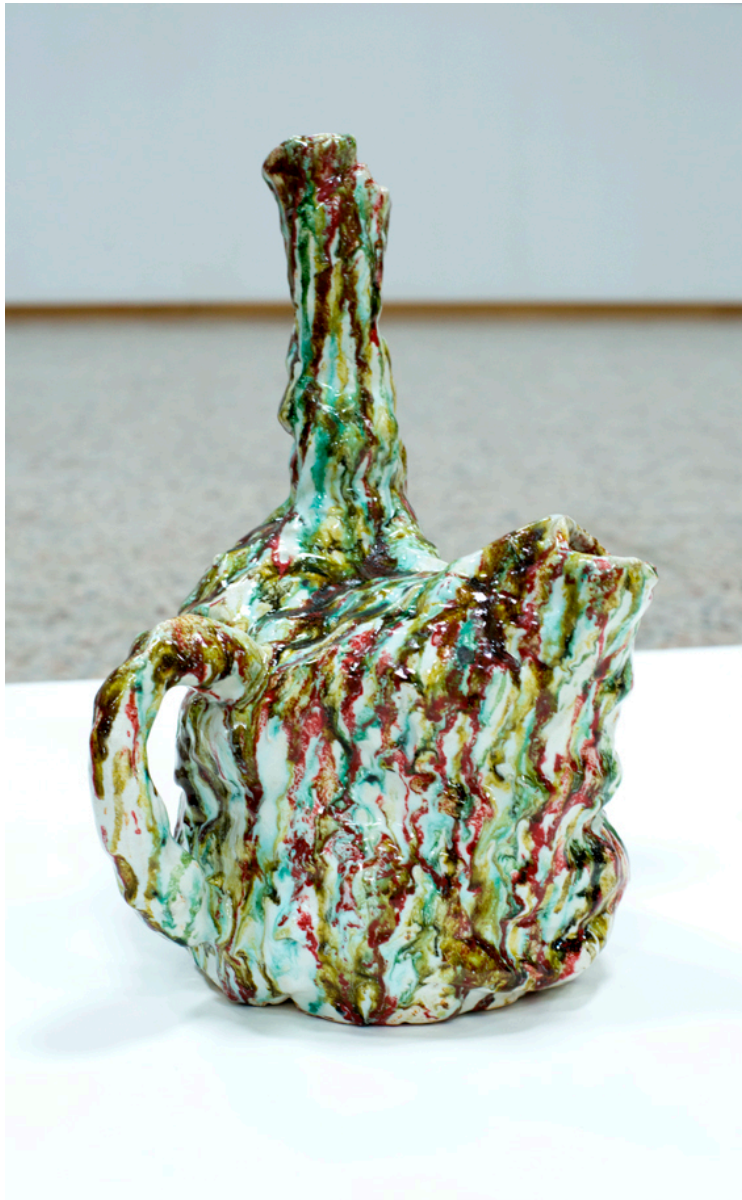
Tent Painting (2014), variable dimensions, canvas, turmeric, wood structure