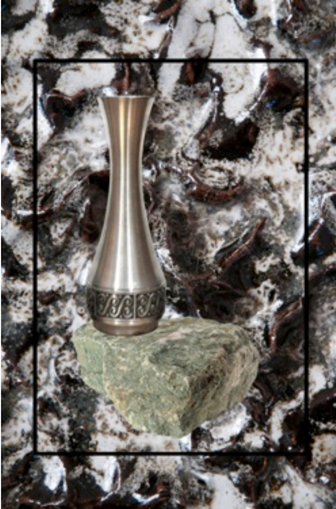
“Structures in Brown”, Passatge, Barcelona, 2012. Diverse medium, dimensions variable