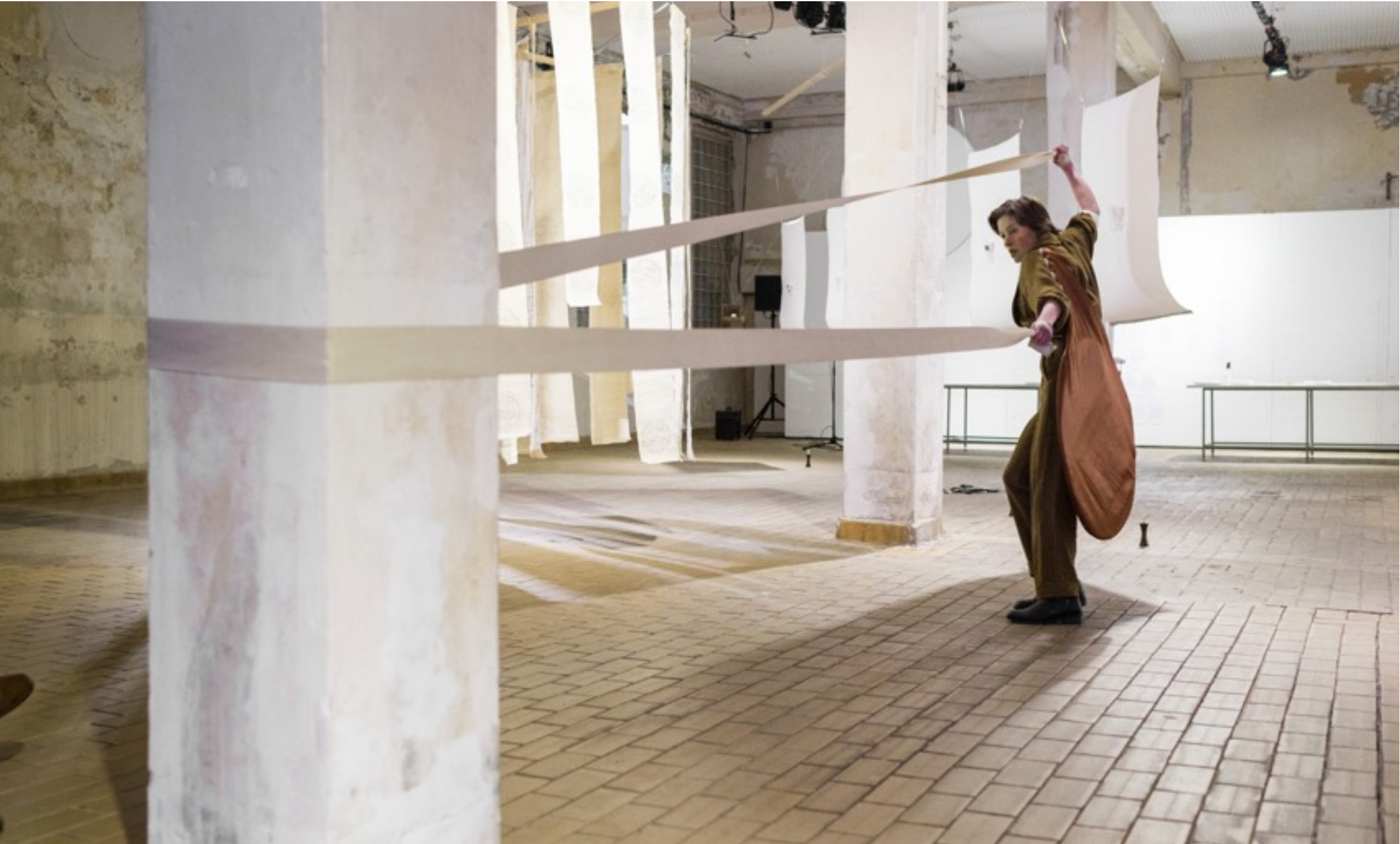
KRINGSATT AV FINDER, EXHIBITION/EVENT, BERGEN KJØTT, BERGEN, 2016