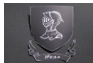
KRINGSATT AV FINDER, EXHIBITION/EVENT, BERGEN KJØTT, BERGEN, 2016