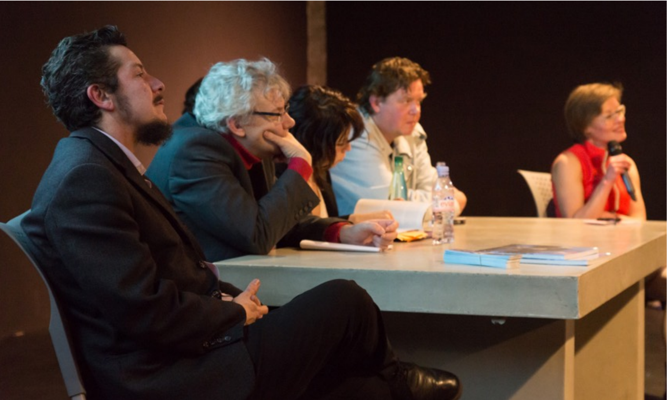
BOOK LAUNCH, PERFORMANCE, PANEL DISCUSSION, PALAIS DE TOKYO, PARIS, 2016