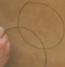
PERFORMATIVE LECTURE SERIES, RAM, OSLO, 2017 (ALSO AT PECKHAM PLATFORM, LONDON, ESPACE MULTIMEDIA GANTNER, BOUROGNE, ECOLE DES BEAUX ARTS, BESANCON, BIT TEATERGARASJEN, BERGEN PUBLIC LIBRARY, HKS, OKTOBERDANS, BERGEN)