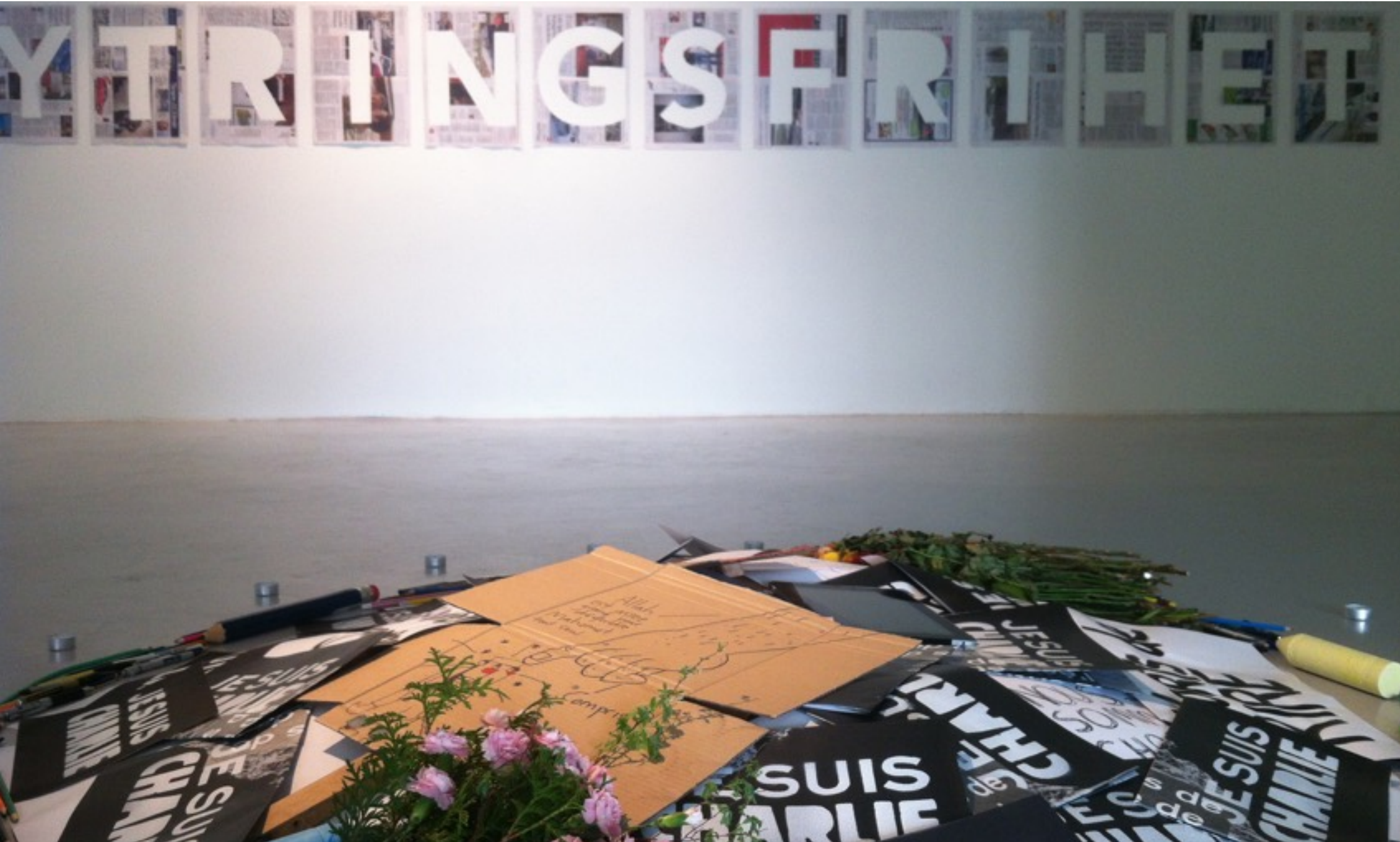
VICTOR CHARLIE EXHIBITION/EVENT, USF, BERGEN, 2015