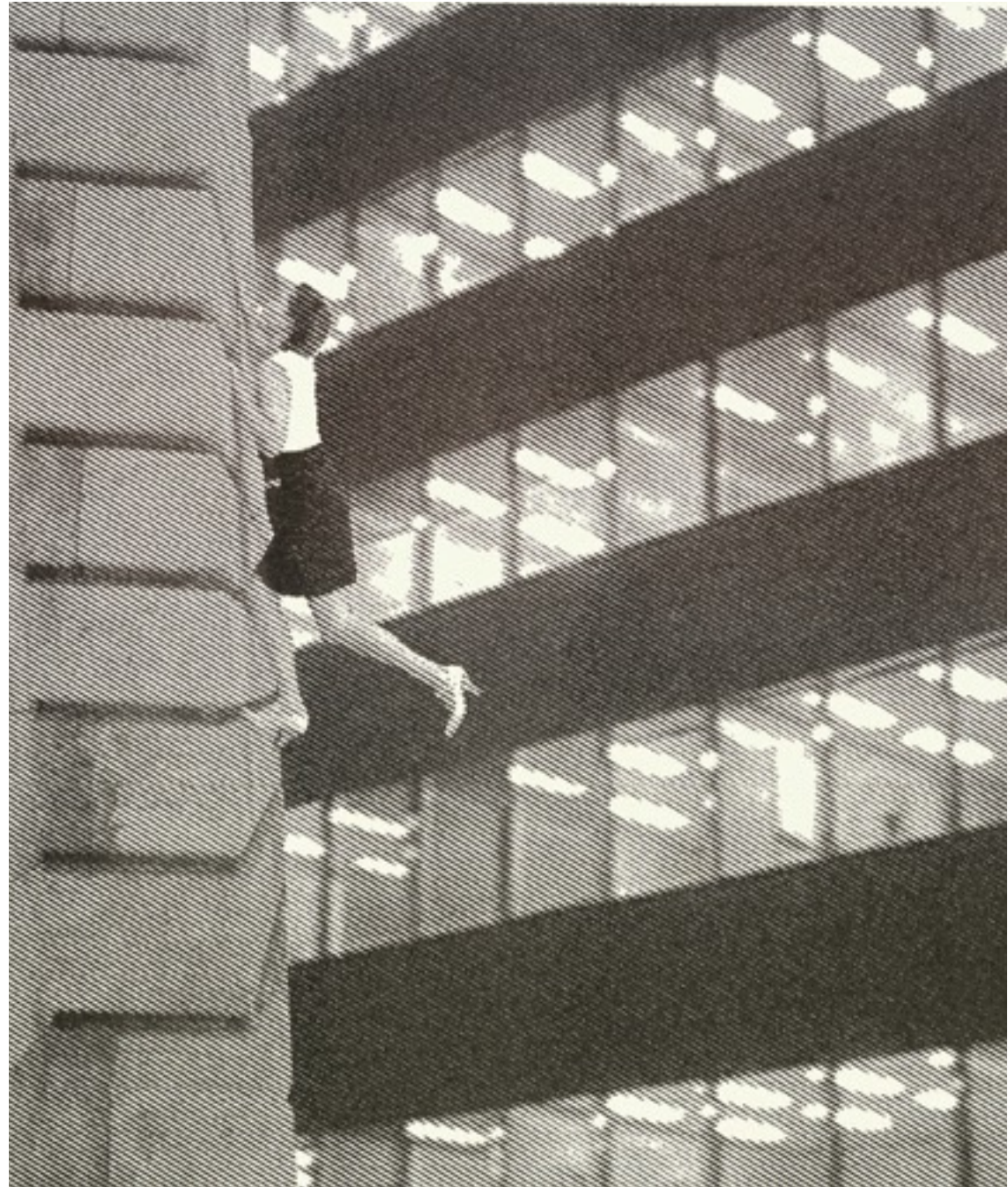
A MOI LE PLAIRE, A TOI LE FAIRE, HARDCOVER, 30X22 CM., 95 P., 2016