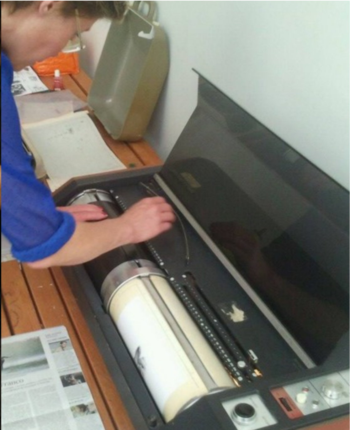
PRINTING STUDIO AND PUBLISHING