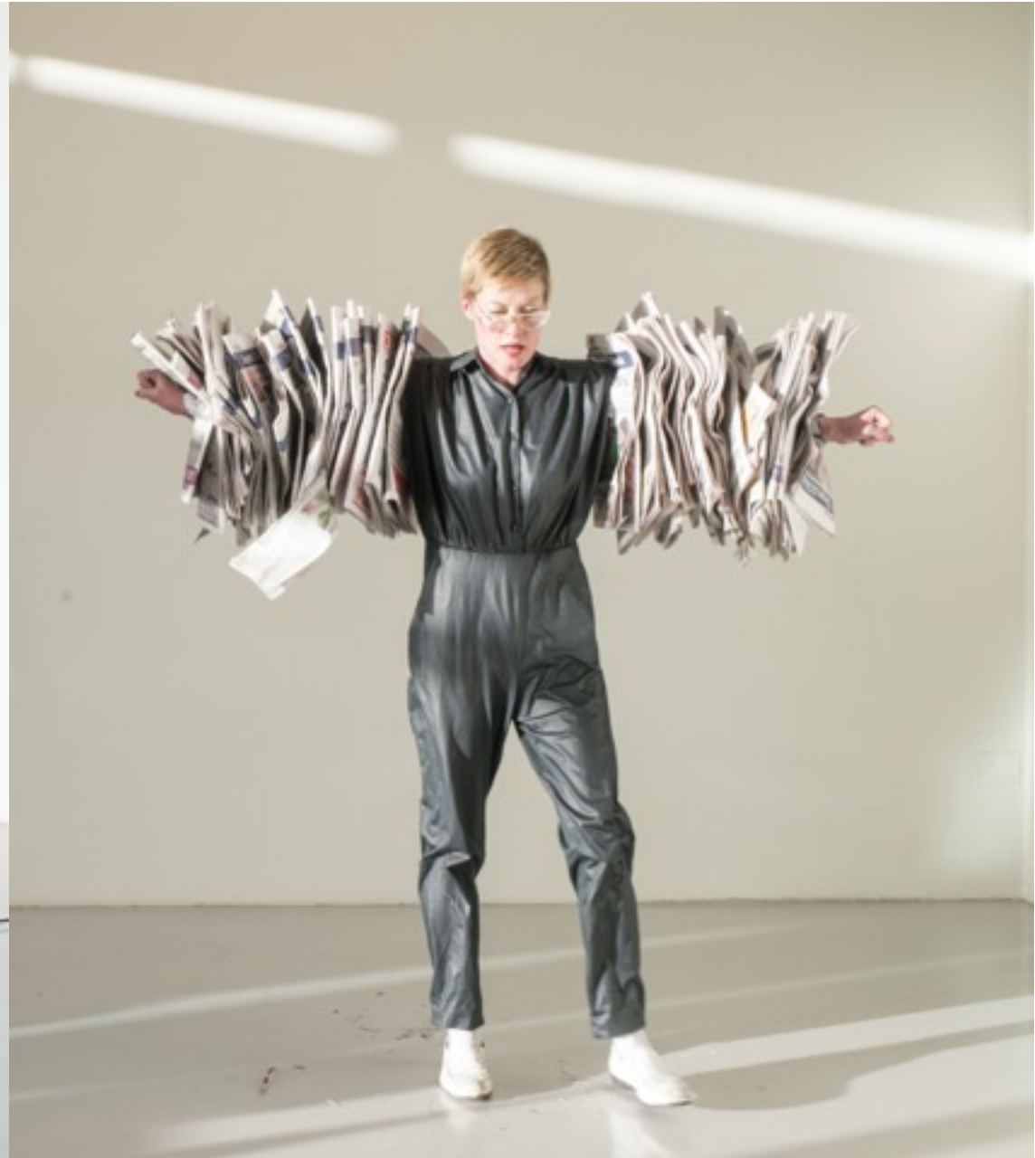
VICTOR CHARLIE EXHIBITION/EVENT, USF, BERGEN, 2015