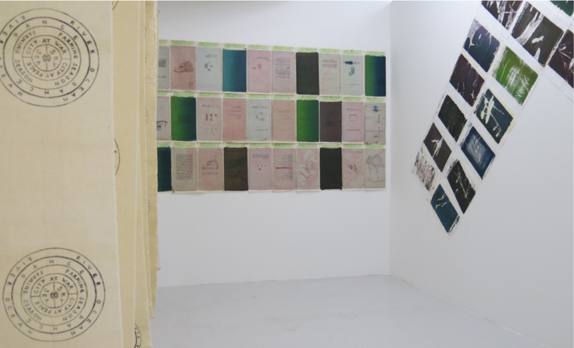
EXHIBITION, KUNSTGARASJEN HANSKEROMMET, BERGEN, 2017