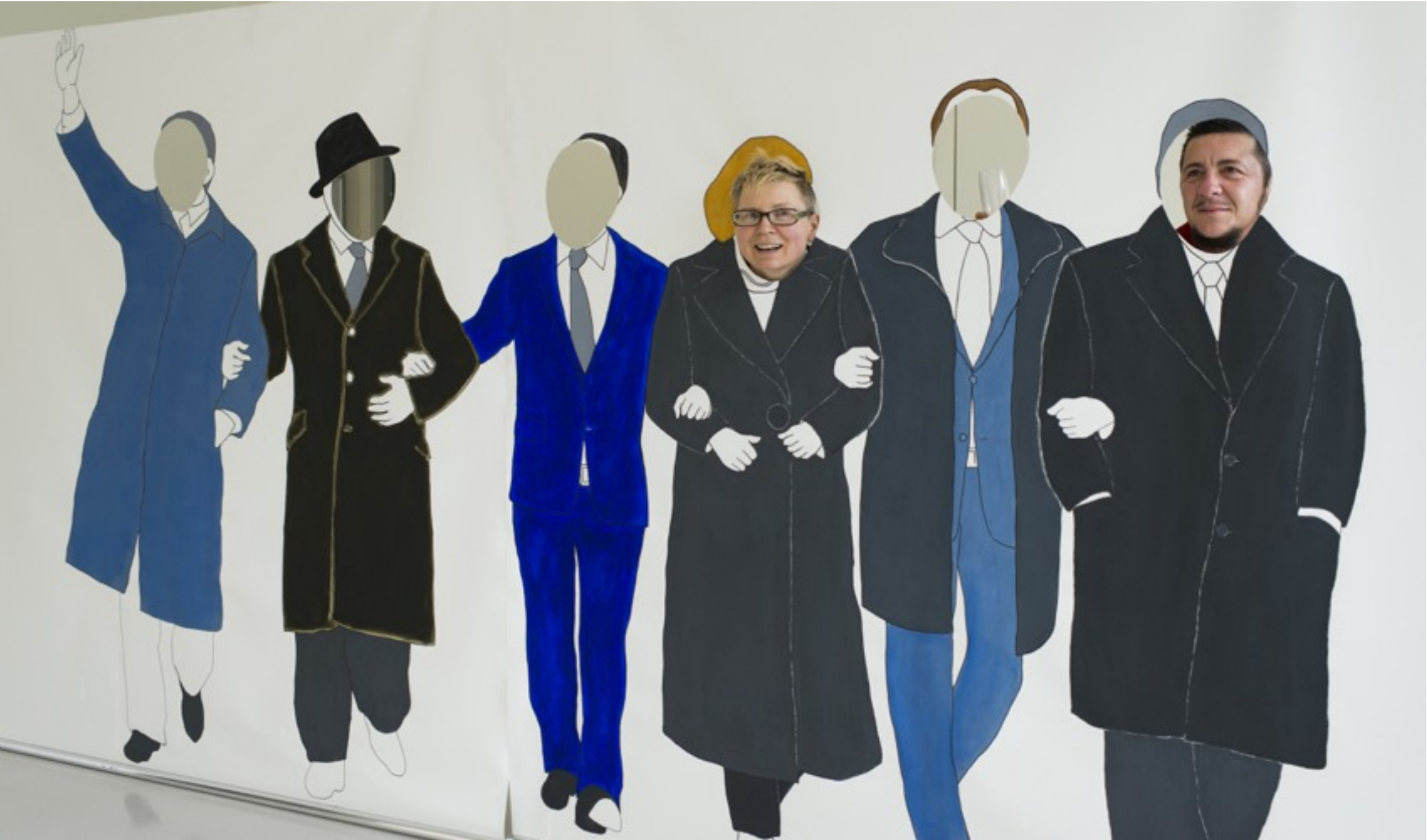
VICTOR CHARLIE EXHIBITION/EVENT, USF, BERGEN, 2015