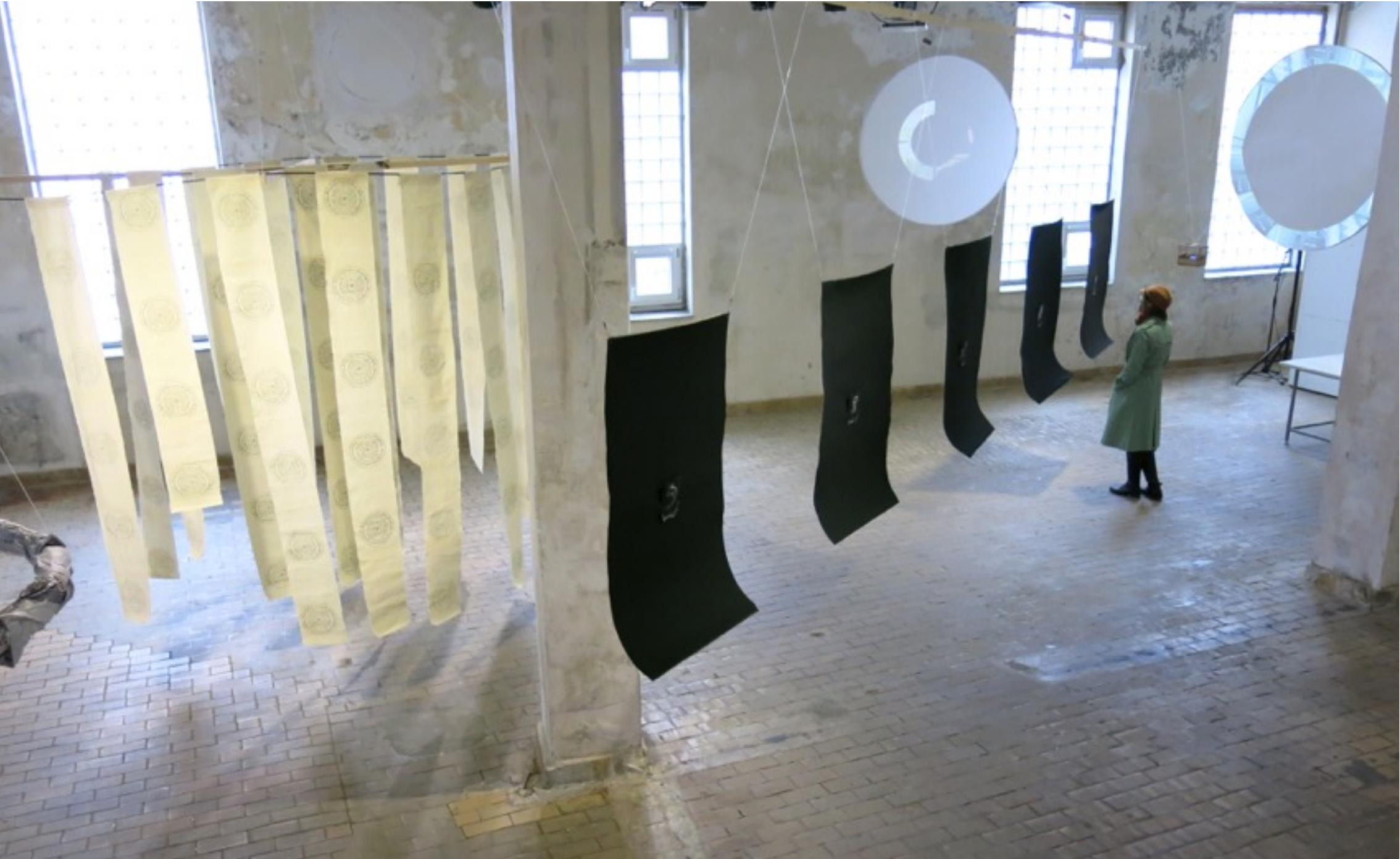
KRINGSATT AV FINDER, EXHIBITION/EVENT, BERGEN KJØTT, BERGEN, 2016