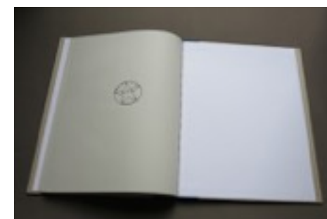
VICTOR CHARLIE, POST EXHIBITION CATALOGUE, HARDCOVER, 30X22 CM., 105 P., 2016