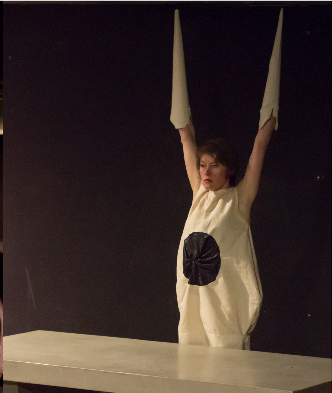
BOOK LAUNCH, PERFORMANCE, PANEL DISCUSSION, PALAIS DE TOKYO, PARIS, 2016