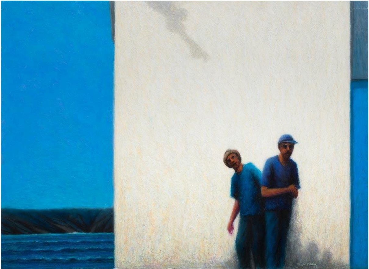
Philip Archer (Principal) 'Our Terrace is a Lookout Post' oil pastel on board