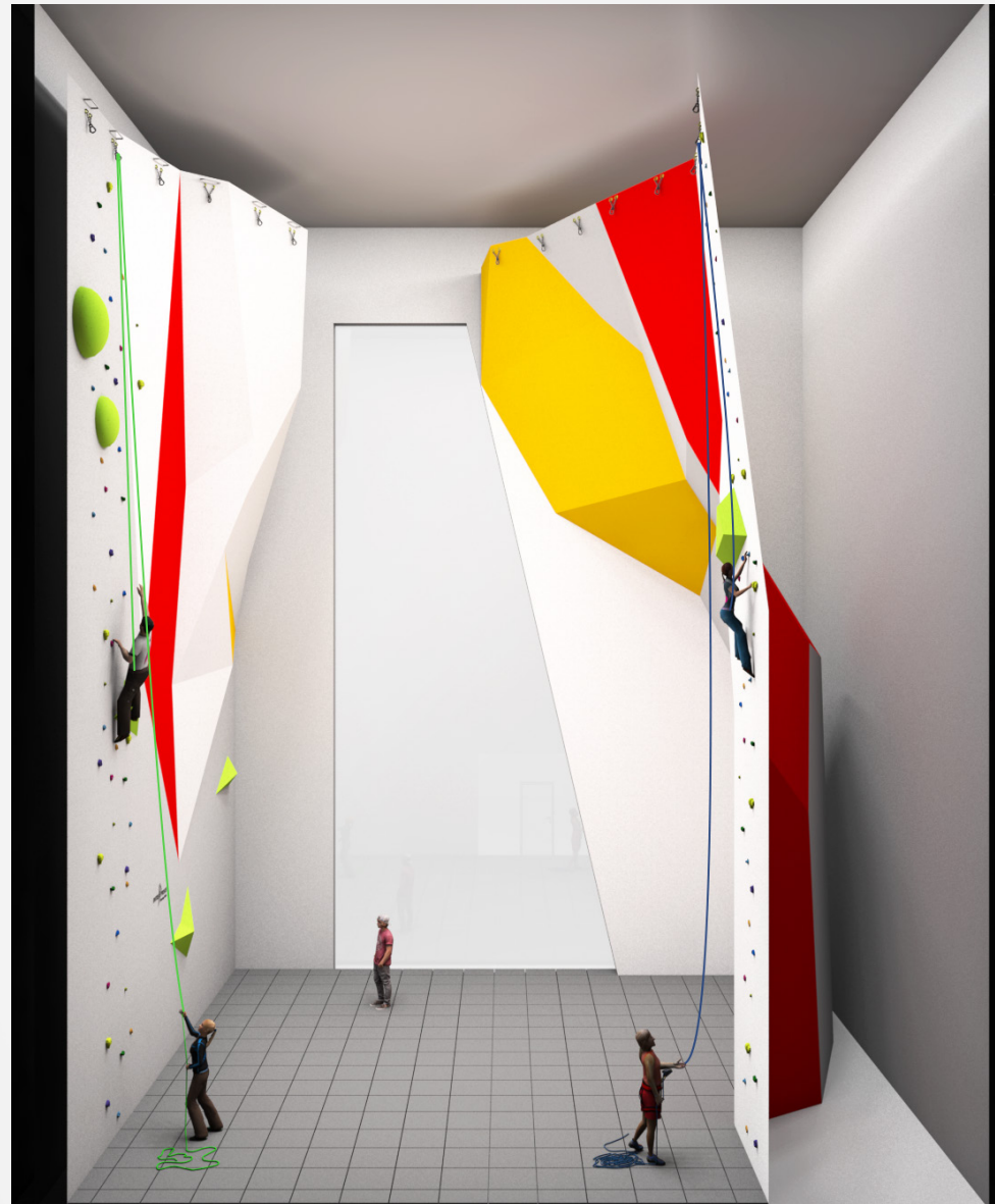
GENERAL SECTION ON BOTH 14M LEAD WALLS