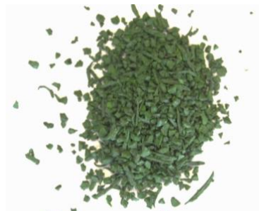
Illustration 3: Limonta Sport X-Tre

The elastic granule is advertised as having high use durability: Excellent resistance against UV, ageing, and wearing trample, no dust on the field, and high stability 59 . The rubber is fibrillated in the granulation and the supplier states that better bond is obtained in the filler material and spreading as well as splash is minimized compared to traditional SBR infill. The minimization of spreading has been observed with control measurements on field sides, but there is no scientific proof yet 60 .