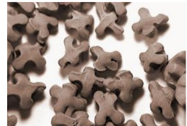
Illustration 4: Limonta Sport TP

TPE is distinct from EDPM rubber in that the material is not vulcanised. Instead, the mesh structure of the product is created by the styrene segments forming crystalline domains 76 . The structure of TPE is maintained without addition of reinforcing agents and stabilizers 77 . The TPE is heated and compressed into grains or other shapes and afterwards cooled down to preserve its shape 78,79 .