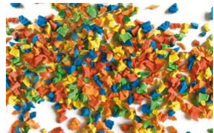
Illustration 5: Gezofill

EPDM is a generic term and the source, formulation, and quality of the material can vary greatly 111,112 with only limited possibility for a layman to see the difference 113 . Cowi reports in 2012 that the quality of rubber granulates based on EPDM differs: Good quality EPDM is well suited for use in artificial turf, but some suppliers use a lot of chemical fillers or recycled EPDM, which can cause the rubber granulates to crumble, resulting in poor quality granulates. Only (expensive) testing of the granulate can show the quality 114 .