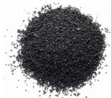
Illustration 2: Genan Fine SBR

Because artificial turf is typically dark and does not vaporize water, the surface can reach temperatures up to 20-30°C higher than for natural grass with measurements as high as 70°C on a 40°C summer day. 27 The rubber has a distinct smell that is especially predominant in hot weather; the smell can be suppressed by irrigation – which also reduces the temperature of the field 28 .