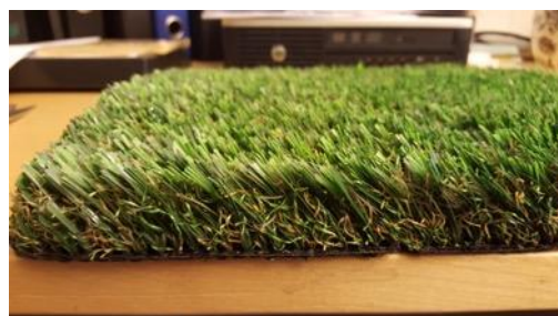
Illustration 7: Sport Vest Trinidad

Prices for the TRINIDAD product in 2018 will be NOK 280-290 per m 2 , with the turf delivered as standard in 4m width and length as desired. According to the sales manager of the TRINIDAD product the turf does not need to be replenished or maintained since it does not contain granulate; only raking in the spring when the snow has melted is needed 226 ; NFF states, though, that an artificial pitch must be maintained, even if there is no infill 227 .