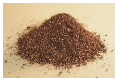
Illustration 6: Limonta Sport Geoplus

Only two fields with GeoPlus infill are established in Norway, one of which is located in Etne Municipality in the southwest of Norway. The field was established in 2014 in order to avoid negative effects of rubber infill 174 . The infill has been supplemented two or three times since the establishment in 2014 with varying amounts of added infill. The maintaining procedures have been corrected in cooperation with the supplier and the field is now raked with a tractor three times a week. Compared to the artificial turf fields with sand infill 175 , where maintenance has been done manually, this process is more resource efficient 176 .