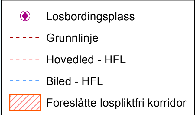
Korsfjorden, foreslått endring