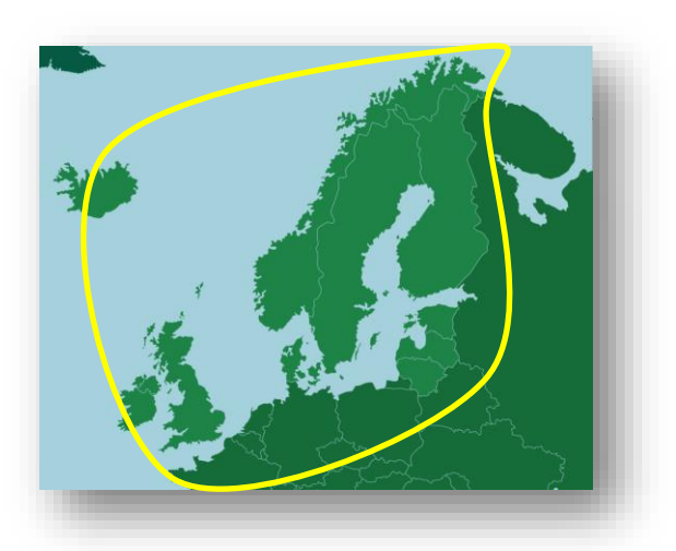
Picture 1: A future region of shore power regulations and framework?